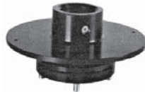
Conversion Adapter 4-65850-6