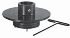
Conversion Adapter 4-55860-7